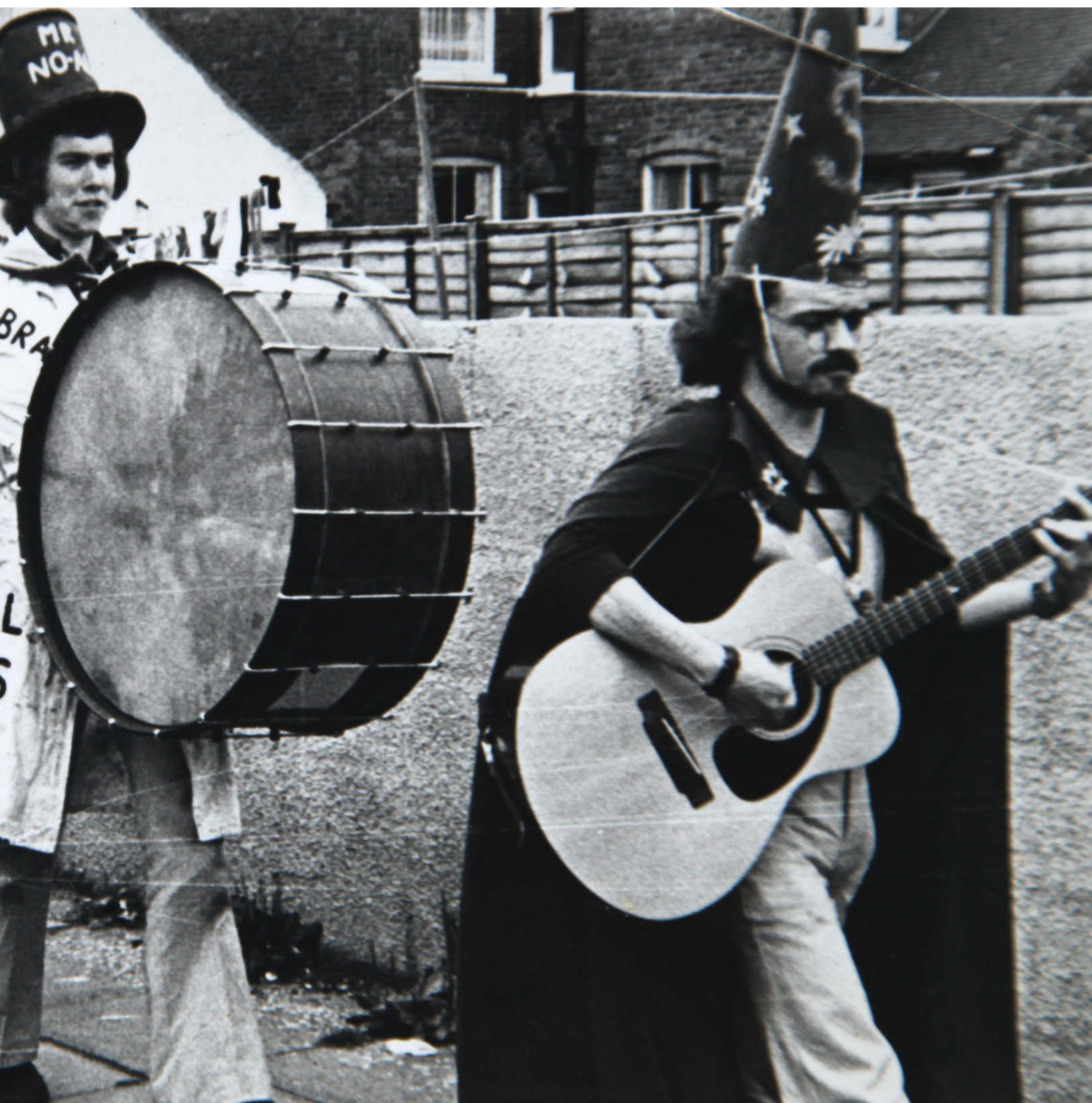
- Jubilee Theatre and Community Arts on the streets of Langley in 1974.