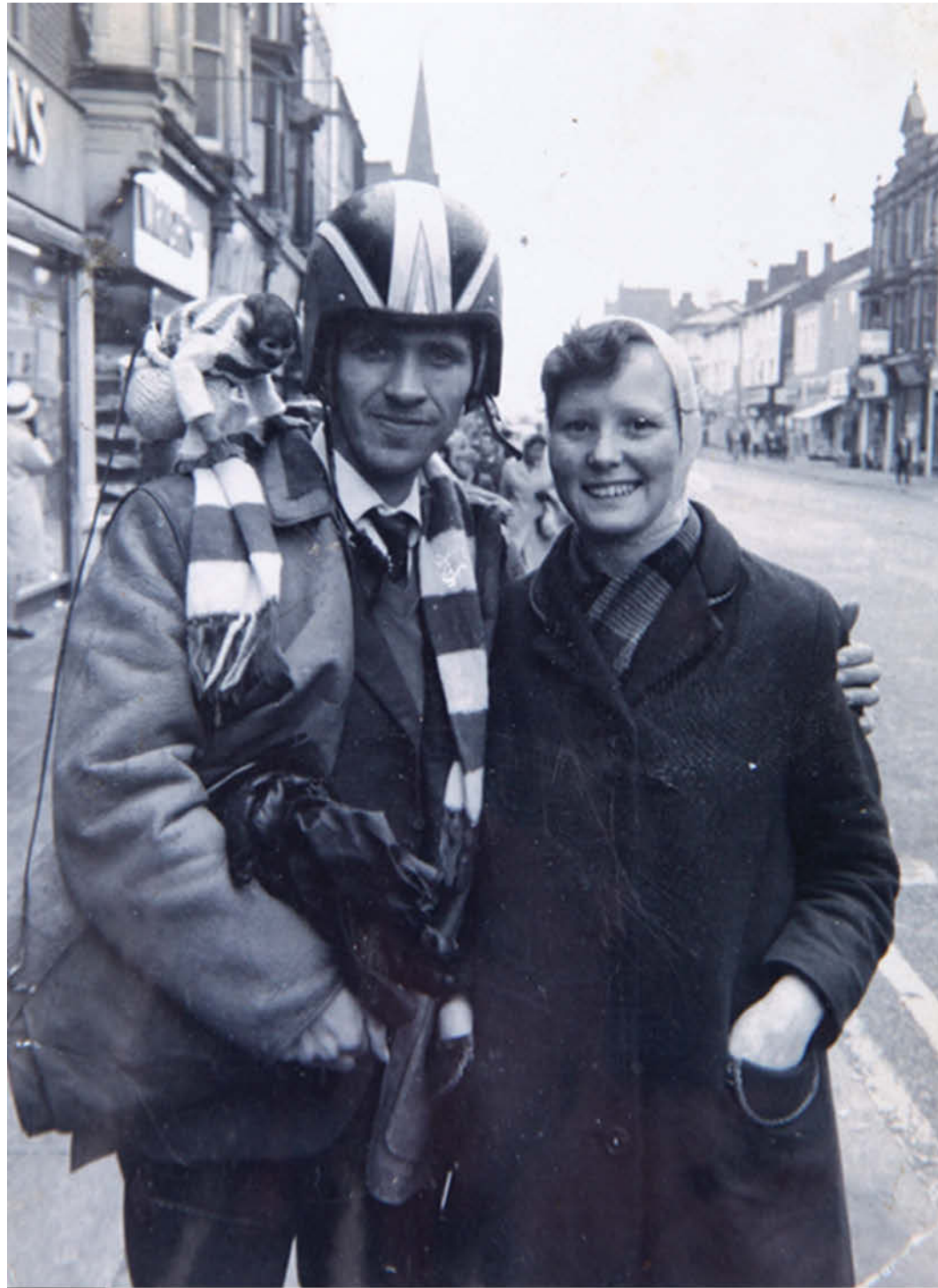
- West Bromwich High Street, 18th May, 1968, the day that Albion won the F.A Cup