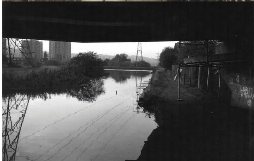
- Titford Pools, under the M5 motorway, 1990 (from 'Sandwell in Black & White').