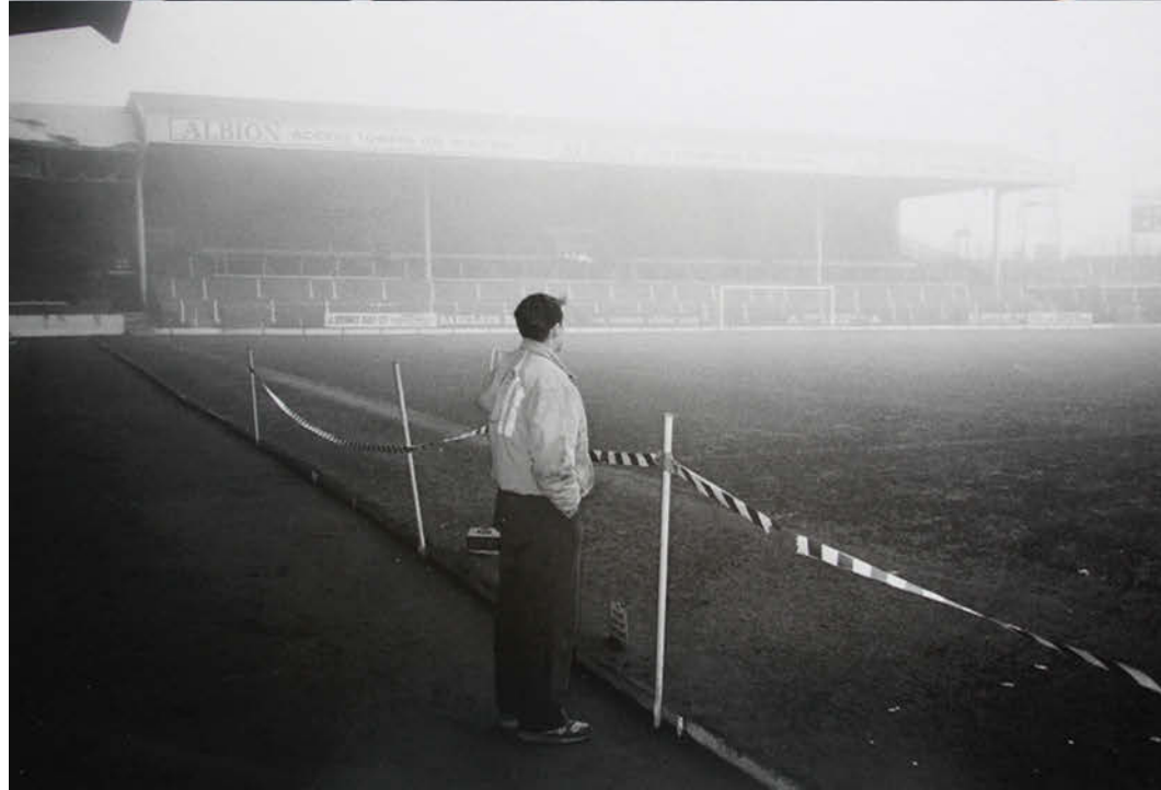
- The Albion ground, November 1990 (from 'Sandwell in Black & White').