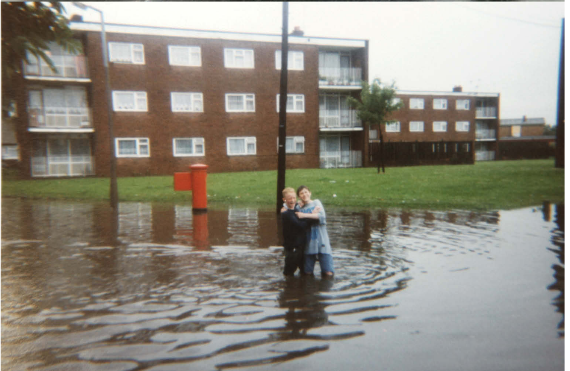
- St. Michael's School, Langley, circa 1953. - Martley Road, 1990's.