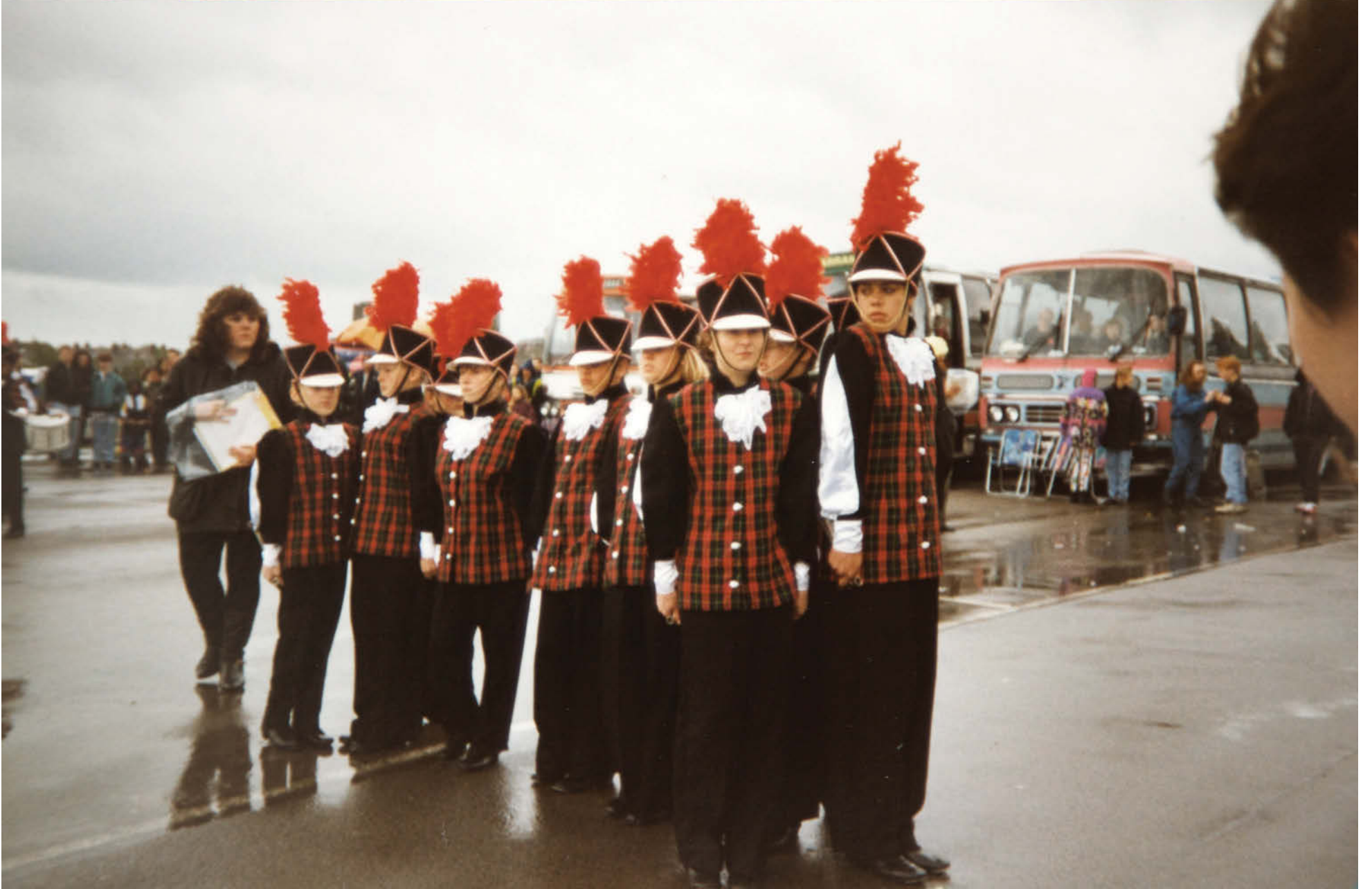
- Vicarage Garden Party, Lion Farm Estate, 1970. - Marching Band, early 1990's.